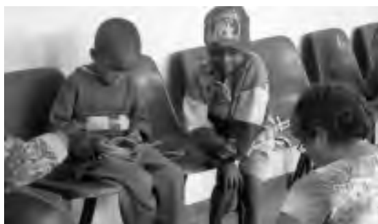
Crafttime with the kids

Thank you, UCOP for being a huge part of this magical work!