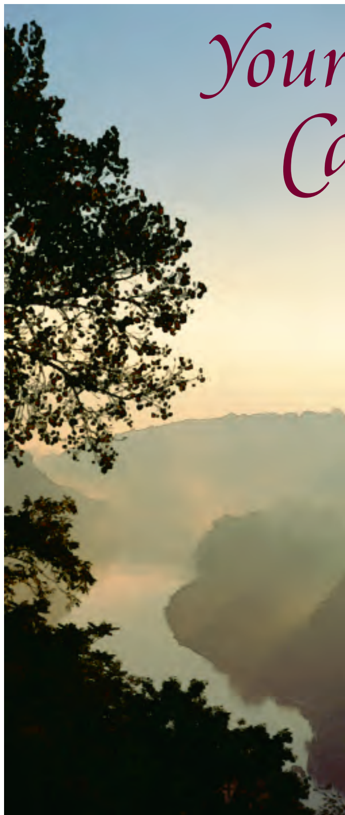
Misty Valley ©2002 Jody Drake