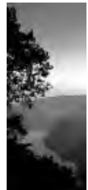
Cover: Misty Valley