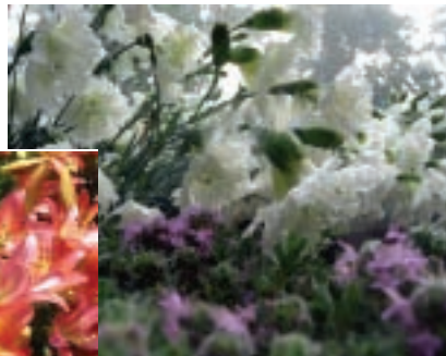
Wooly Thyme & Dianthus