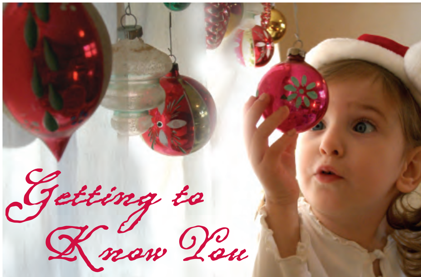
Wonder

W hen I first learned that our Association of Unity Churches International had selected "Getting to Know You" as its theme for the year, I said, "That's it!" That will be our 2008 theme for Unity Church of Overland Park as well.