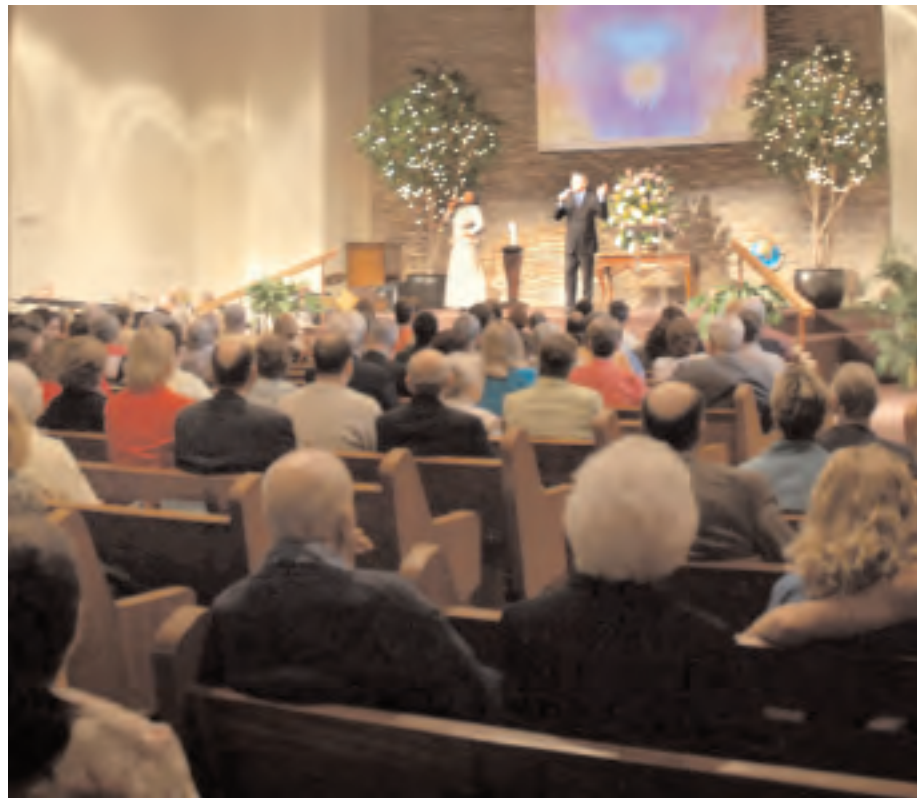
Sunday's at Unity are a time of celebration, inspiration and community.

Church offices will be closed Friday, July 3.