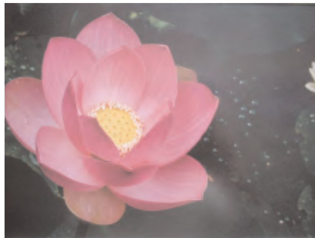
through June 25. Purchase art with the Business Office Monday-Thursday 913.649.1750 x3012.