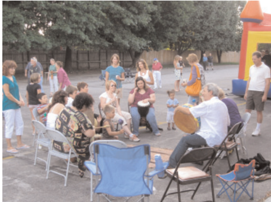
All Age Drumming Circle at Summer Jam Fun Night July 31

Unity Church of Overland Park 10300 Antioch Road Overland Park, KS 66212 913.649.1750 www.ucop.org